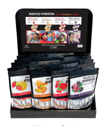
Welcome Pack: 4 Boxes (one of each flavor) Each Box contains 5 Bags-50 Sticks/Bag Promo Counter Display: P/N NX90582