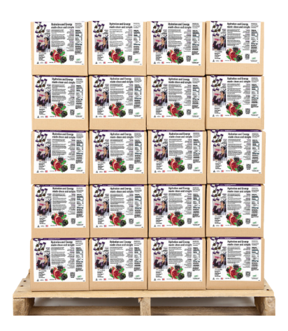
1 pallet = 100 boxes (500 sticks per box)