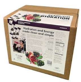
500 sticks per box of Ready/Go® Hydration