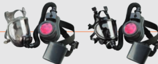
Belt-mounted PAPR †