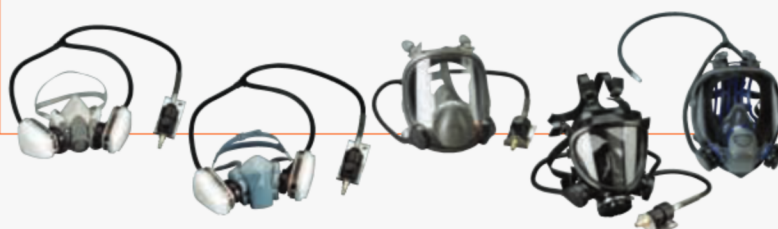
Dual Airline Supplied Air Respirator