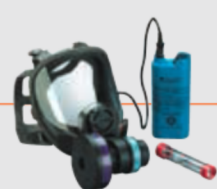
Face-mounted PAPR † (available for 6000 FF only)