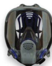
Ultimate FX FF-400