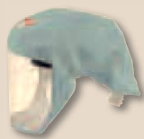
S-100 Series Hoods Product #: S-133LB-5 (shown)