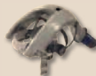
Suspension Product #: S-950 (shown)