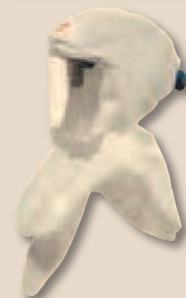
S-600 Series Hoods Product #: S-657 (shown)