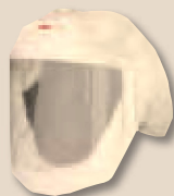
Product #: S-133L-5 (shown)