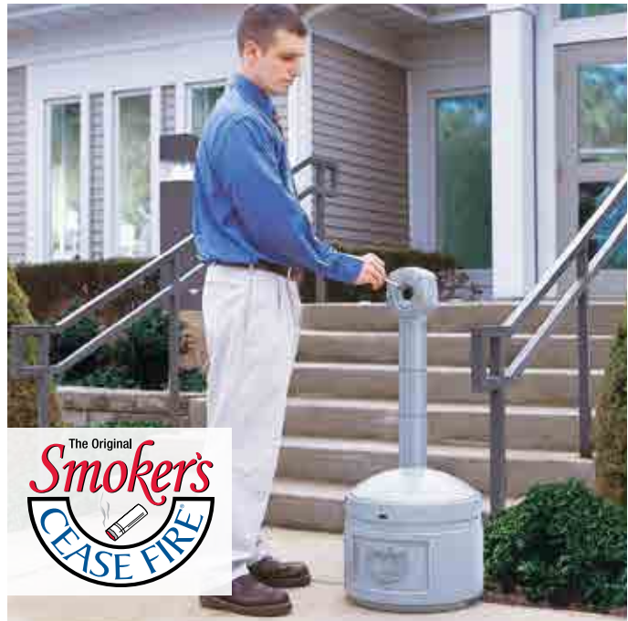
Ideal for any establishment—clean grounds help maintain your business image.

Large covered head dissipates heat and keeps rain out