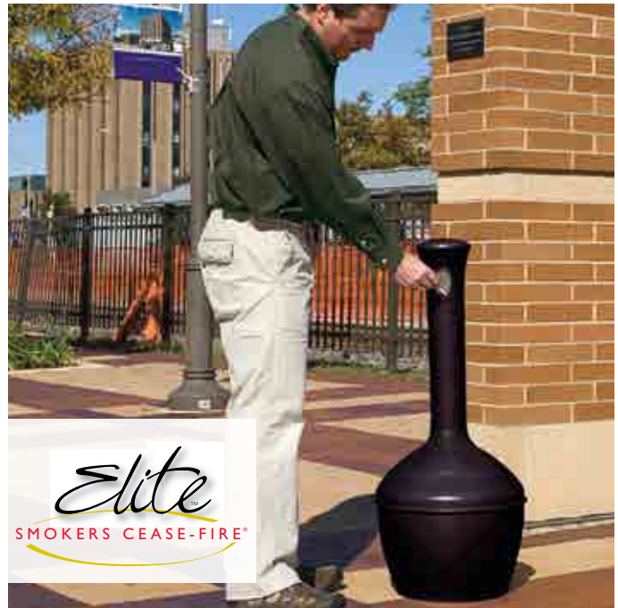
Simply drop in lit cigarette or use perforated snuffer.